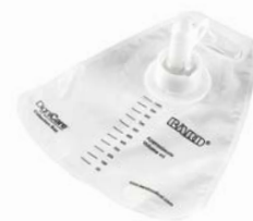
Custom Fitment Pouches