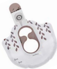
Custom Shaped Bag

For more information on Polyolefins as an alternative, see Novachem.com