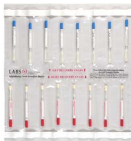
Custom Multi-Compartment Bag